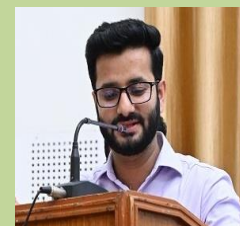
Engineers presenting their papers on World Telecommunication & Information Society Day